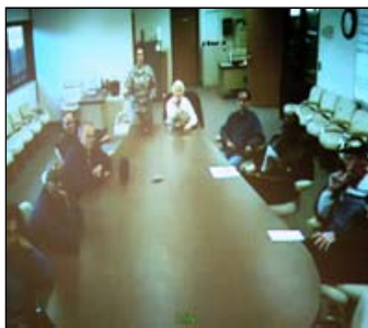
Above: Screen shot of training session participants at remote site.

The training focused on why and when the digital transition will take place and included how to install and operate a digital converter box. Additionally, the training brought to light the importance of having the right antenna that will work in coordination with a converter box.